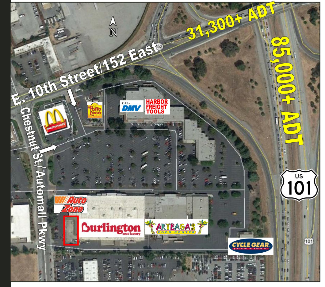
1,156± SF with Attached 7,000± SF Yard Area